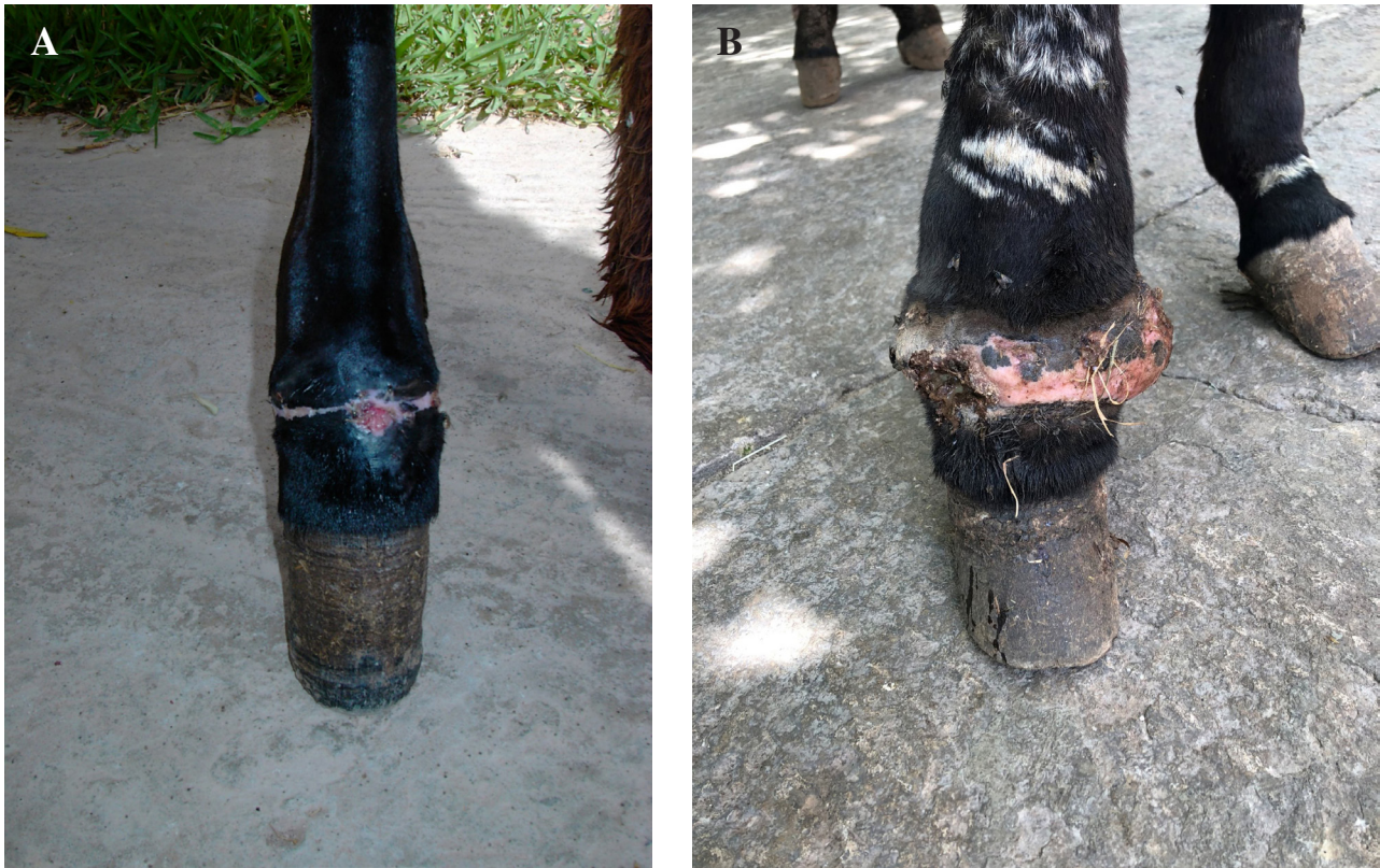
Figure 1. A) Circumferential wound on the right hind pastern with a draining tract and soft tissue swelling around and above the hobbling materiel (wire in this case); B) Extensive circumferential fibrosis with severe swelling (the hobbling materiel in this case was a bailing twine).